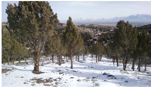
Figure 3: Properly limbed tree and spacing