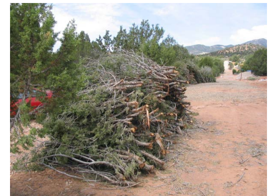
Figure 2: Proper chip pile construction