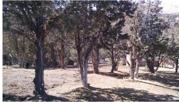
Figure 1: Thinned Understory

FORESTRY, FIRE & STATE LANDS WASATCH FRONT AREA OFFICE 1594 W North Temple, Suite 150 Salt Lake City, UT 84114 www.ffsl.utah.gov